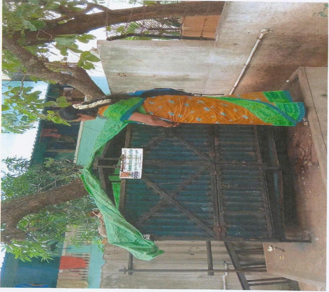
KGeYes Homes @ 173 Division