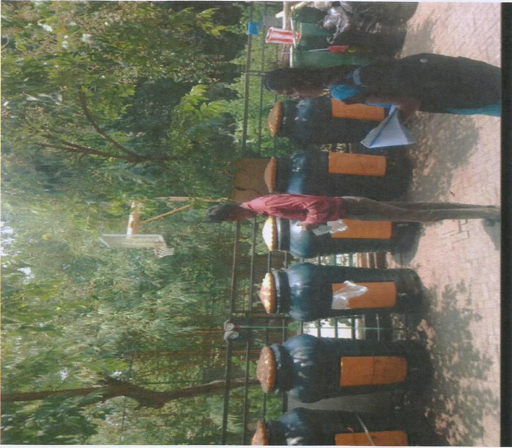
Ceebross Beleivender Apartment