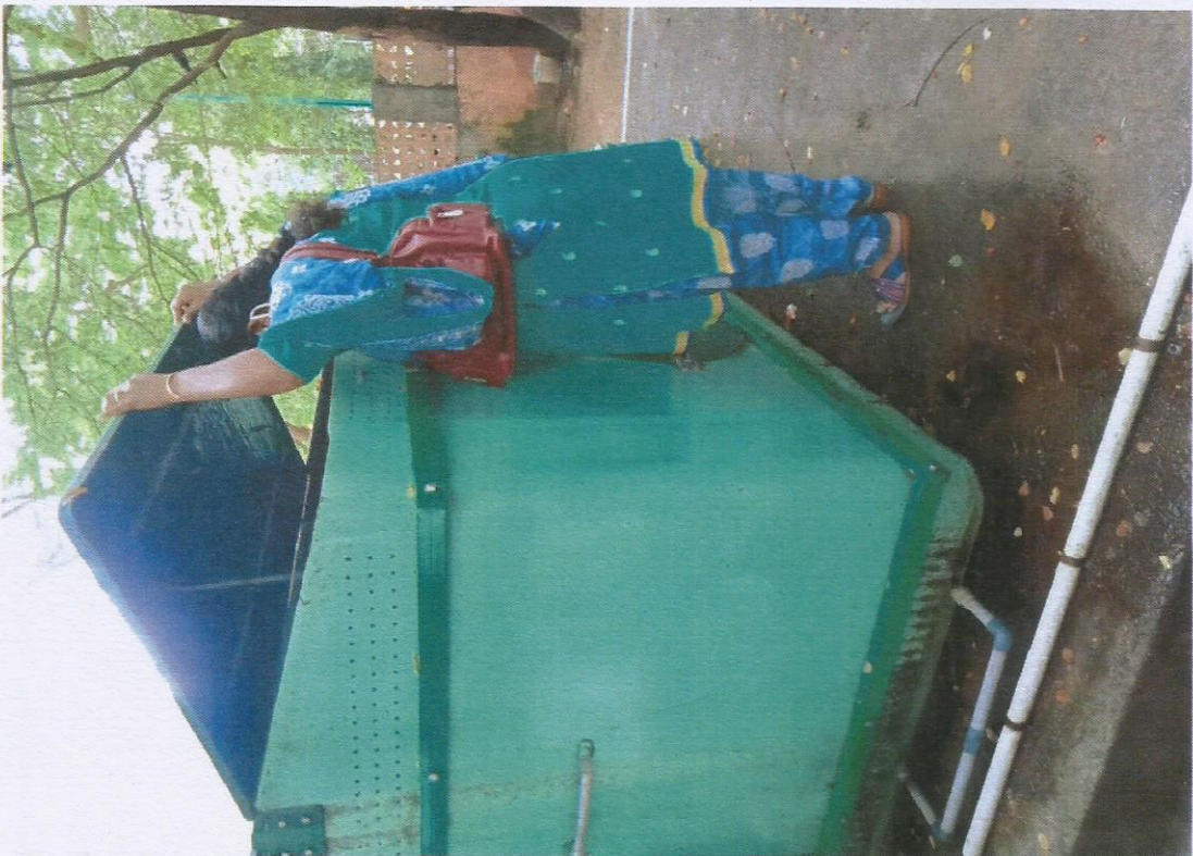
CPWD Quarters, Indhira Nagar @ 173 Division