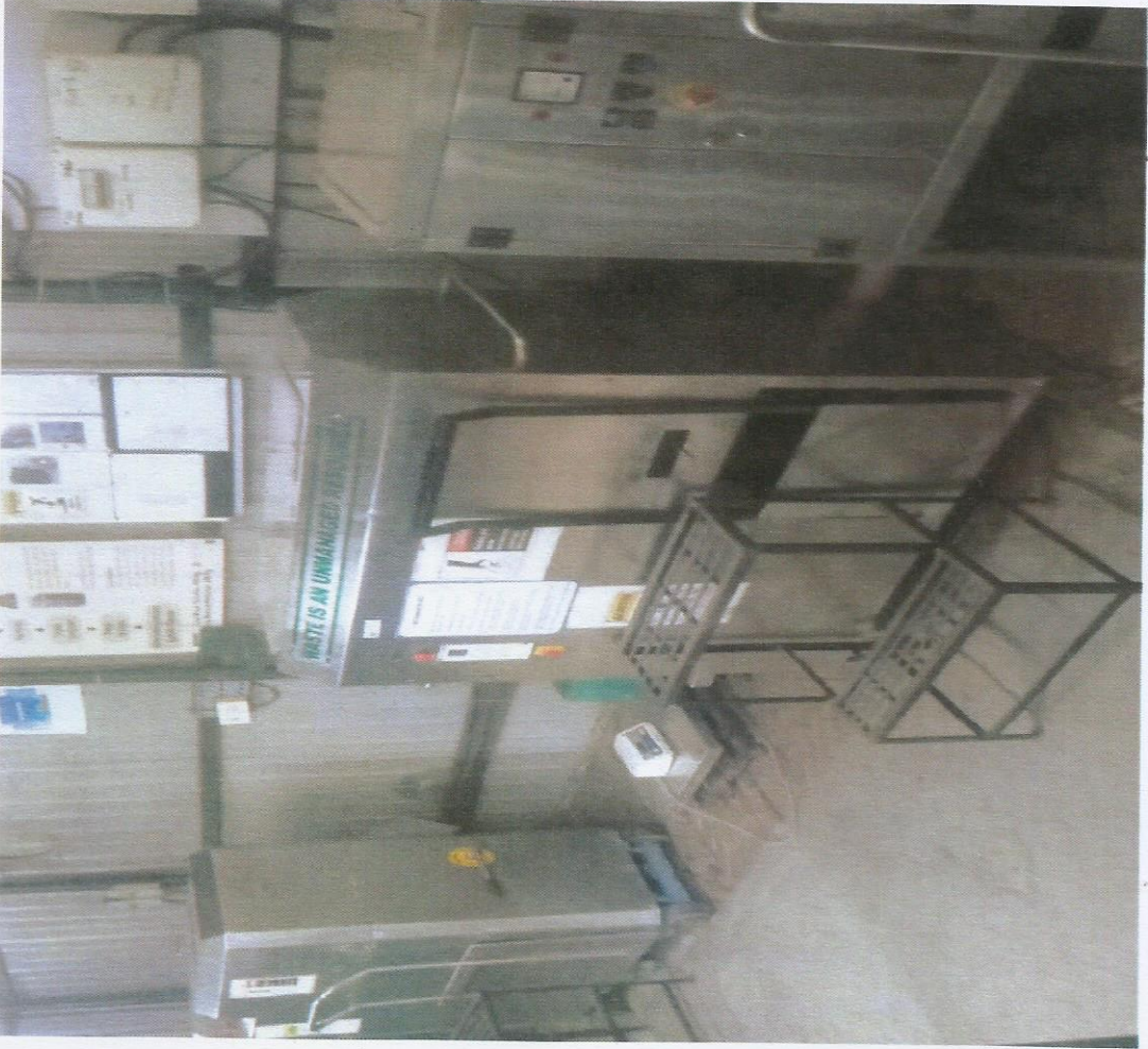
Ramanujam IT Park @ 178 Division