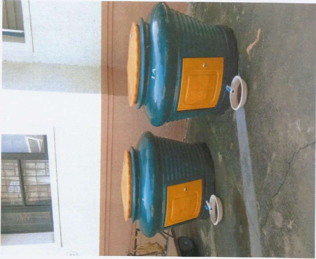
Artrium Flats @ 179 Division