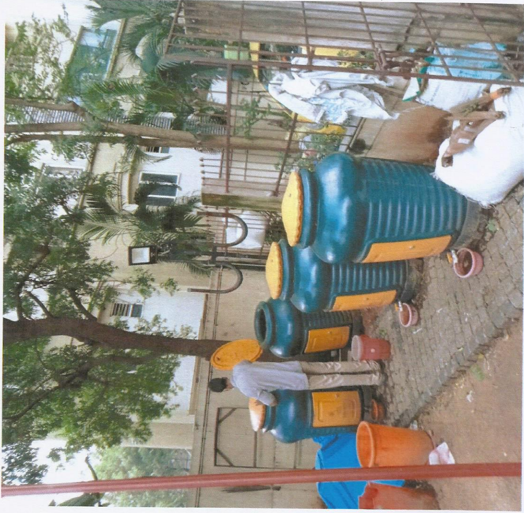
Prime Terrace Apartment, LB Road @ 173 Division