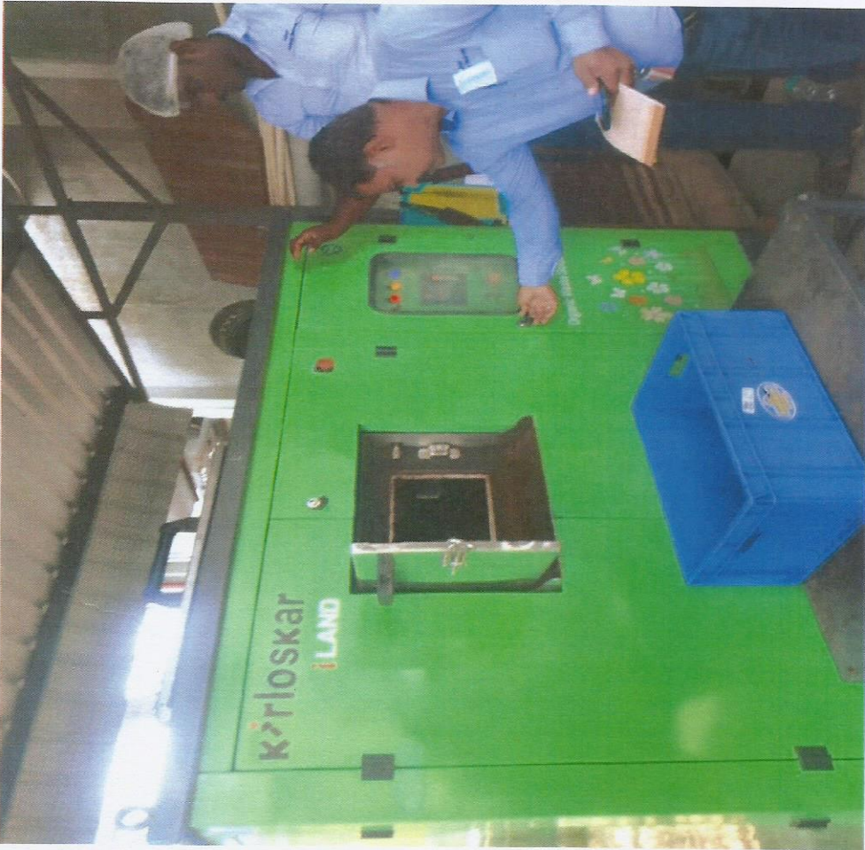
Adyar Anandha Bhavan @197 Division